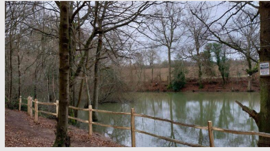
A section of the new fence beside the path at Black Bottom pond

a fence at Black Bottom between the public footpath and the bank. This will prevent walkers (and their dogs) from accessing the lake and allow the bank, which has become heavily eroded and degraded, to return to a more natural state.