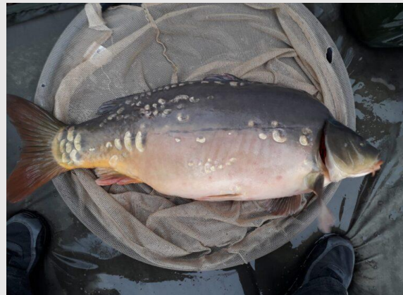
"Bubbles" about to meet her new home

Plans to introduce other stock – notably large tench, roach and bream – mentioned in the previous newsletter have not yet been realized due to difficulties in sourcing suitable stock. The club has set aside a fund to pay for this and expects to carry out the stocking in due course. At present, reports indicate our waters hold a large stock of fish.