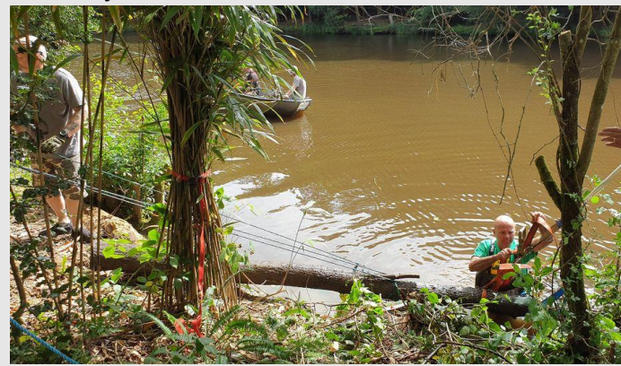
A busy scene from Roosthole working to remove a tree that had fallen into the lake

In addition to regular maintenance work to keep venues fishable, the committee will focus on its efforts on the ongoing project to improve Roosthole. Further applications of bio-aqua will be required to deal with the organic sediment and fish stocks will be assessed by electro-fishing,