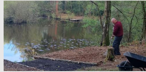
Pete Collins hard at work, as he often is, improving swims at Island Pond

Members should take extra care fishing BSA lakes as the water becomes very deep, very quickly.