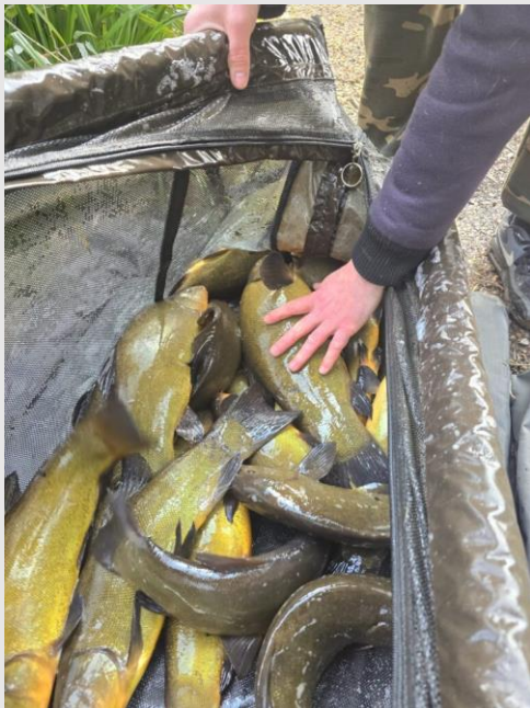
Tench about to go into Roosthole

Two specimen carp were stocked at Birchenbridge, whilst decent-sized Tench and roach were stocked at Sun Oak. Tench have been added to Roosthole, paid for by a generous donation from a former member of the club, Paul Meehan. Birchenbridge also received a small number of tench (around 15) in the same size bracket.