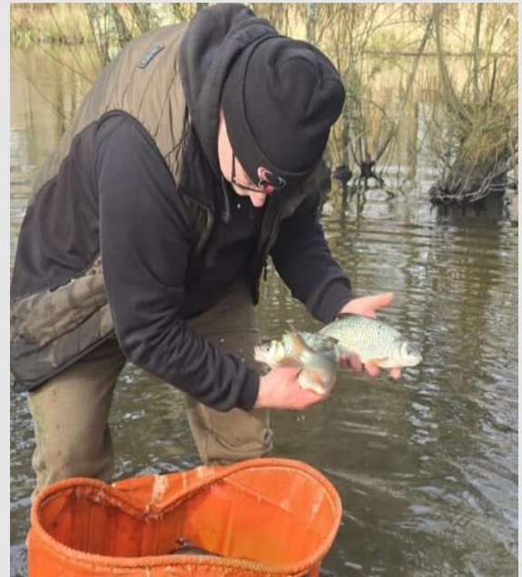
Some of the roach stocked at Sun Oak