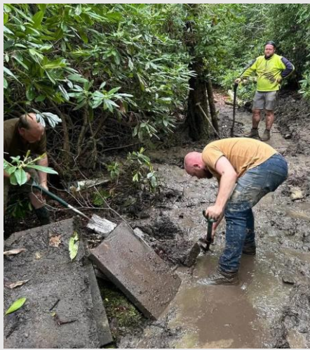
Muddy work on at Birchenbridge