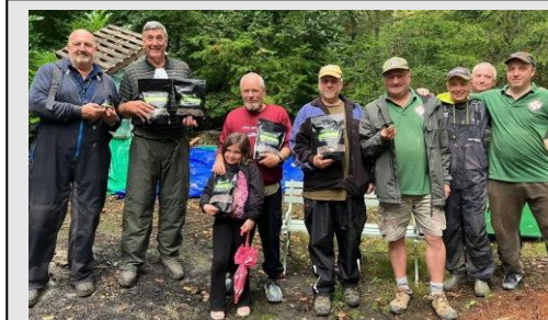
After a match at Roosthole